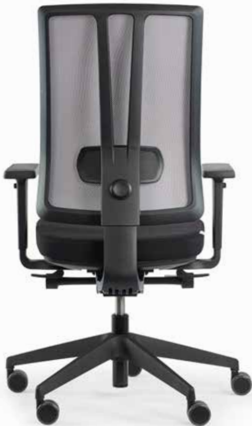
MODELL ceto ново CN25GH1L2