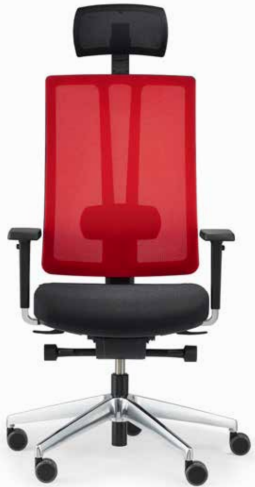
MODELL ceto ново CN95HQ1L4