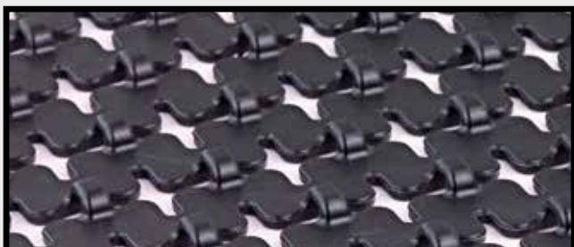
M seat membrane seat plate