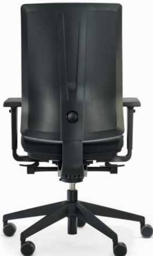
MODELL ceto ново CN23IH1L2